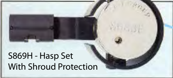
S869H - Hasp Set With Shroud Protection