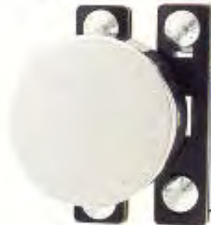
S820T - Hasp Set special application

Accommodates Puck Style Locks Located On Pages 4-5