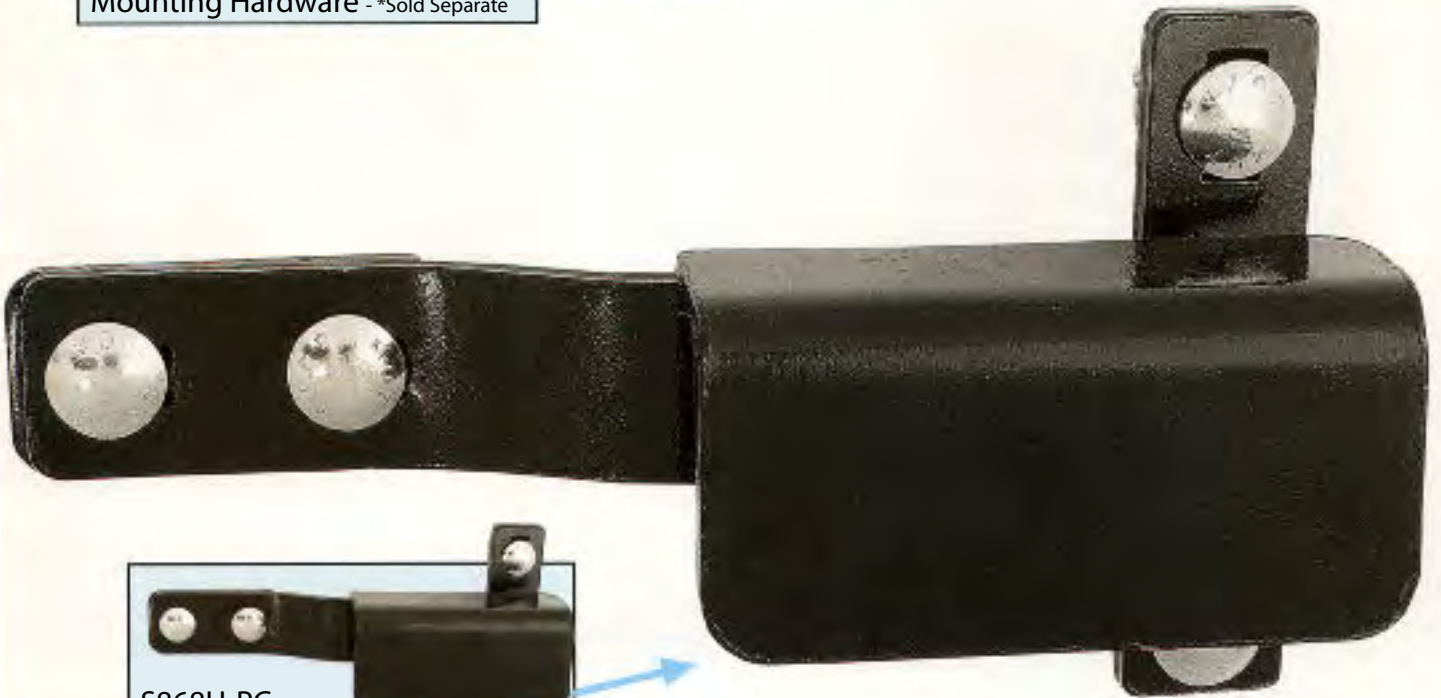
S868H-PC Hasp Set With Padlock Cover