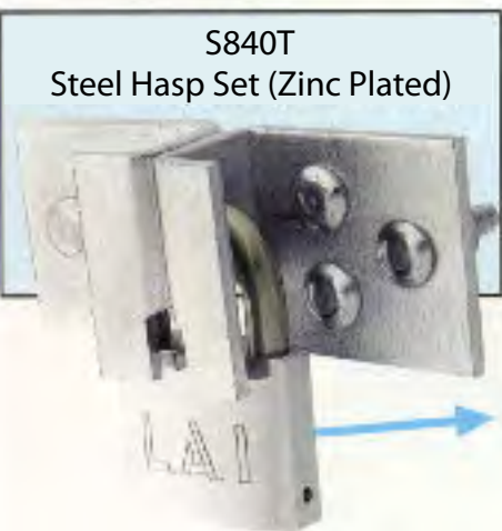
S840T Steel Hasp Set (Zinc Plated)

Shrouded to protect padlock shackles from bolt cutter attacks