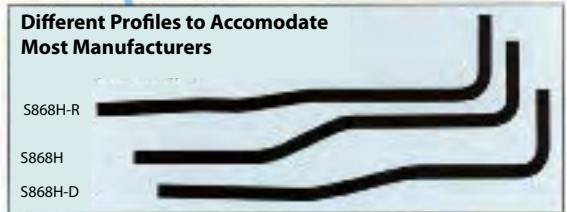
Different Profiles to Accomodate Most Manufacturers