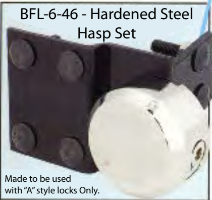
BFL-6-46 - Hardened Steel Hasp Set

Made to be used with "A" style locks Only.