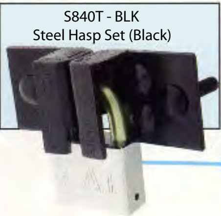
S840T - BLK Steel Hasp Set (Black)